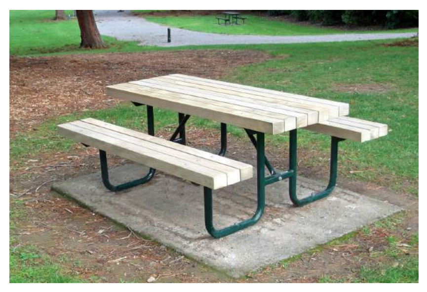
This Parklands Setting is located in Upper Hutt

Timber finishing options are available and the steelwork can be powder coated to your colour of choice.